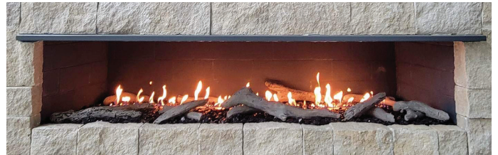
Vented Linear Burner shown with optional Driftwood Log Set. Available for Vented Only

Engineered for quality and performance, our proprietary Isoflames™ Linear Burners create a vibrant, natural flame that feels both luxurious and effortless.